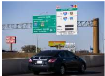
Toll Rate Sign (TRS)

*TSA (Tolling Services Agreement) **TSP (Tolling Services Provider)